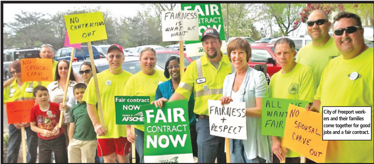
City of Freeport workers and their families come together for good jobs and a fair contract.