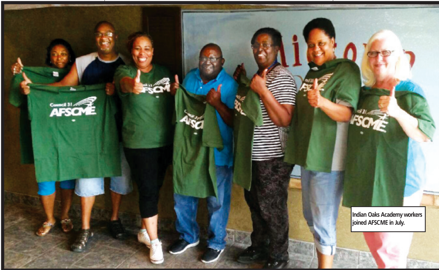
Indian Oaks Academy workers joined AFSCME in July.

Looking for fair treatment, respect and support, more than 200 workers formed a union for good jobs and improved care of vulnerable youth