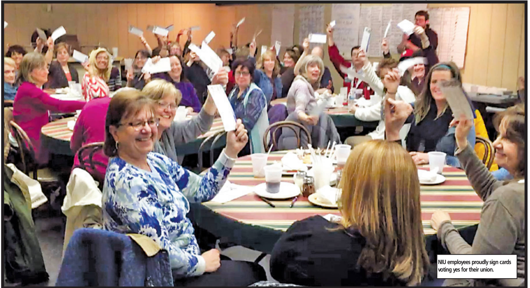
NIU employees proudly sign cards voting yes for their union.

At Northern Illinois University, many staff members had gone more than five years without a pay raise