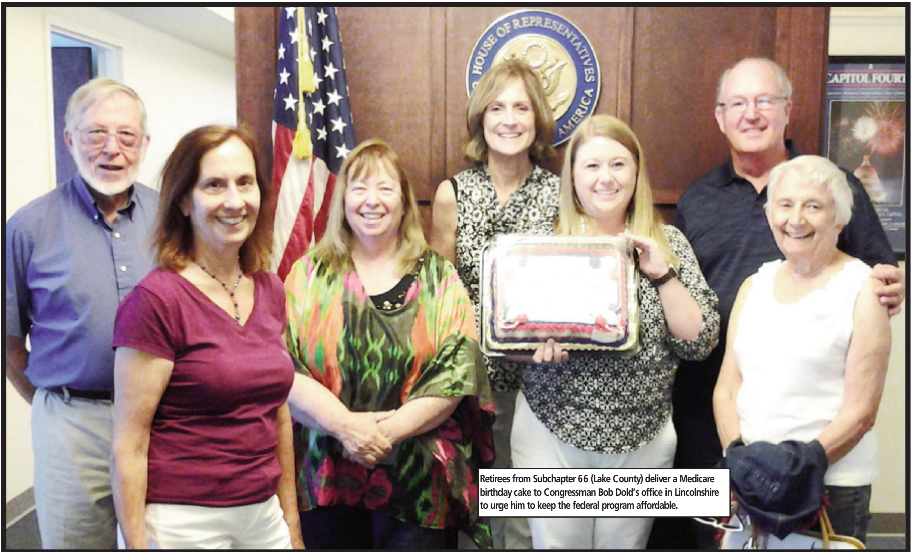
Retirees from Subchapter 66 (Lake County) deliver a Medicare birthday cake to Congressman Bob Dold's office in Lincolnshire to urge him to keep the federal program affordable.