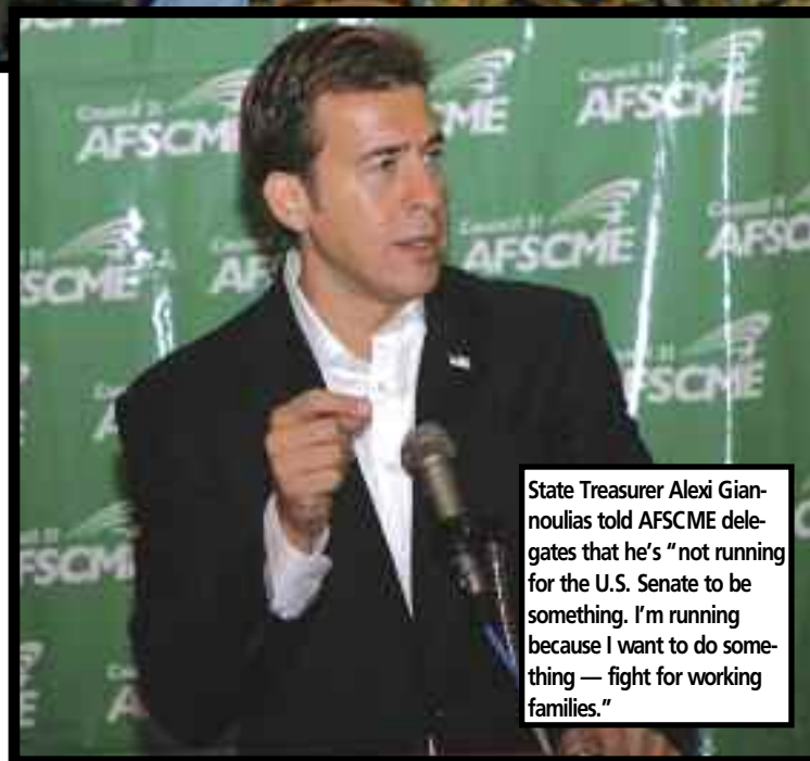
State Treasurer Alexi Giannoulas told AFSCME delegates that he's "not running for the U.S. Senate to be something. I'm running because I want to do something — fight for working families."

U.S. Rep. Mark Kirk eliminated himself from getting the endorsement for the Senate by compiling a measly 20 percent lifetime AFSCME voting record in his five terms in the House. His opponent state treasurer, Alexi Giannoulas got the union's nod in large measure because he