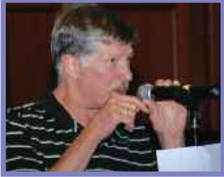
Delegates make recommendations for Election 2010