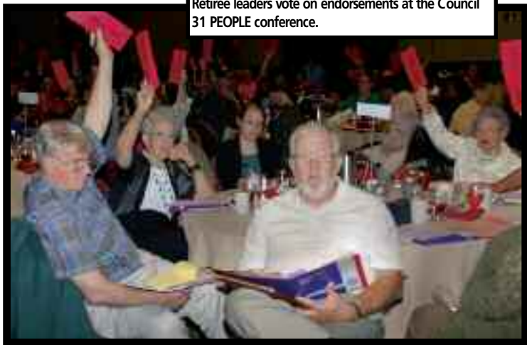
Retiree leaders vote on endorsements at the Council 31 PEOPLE conference.