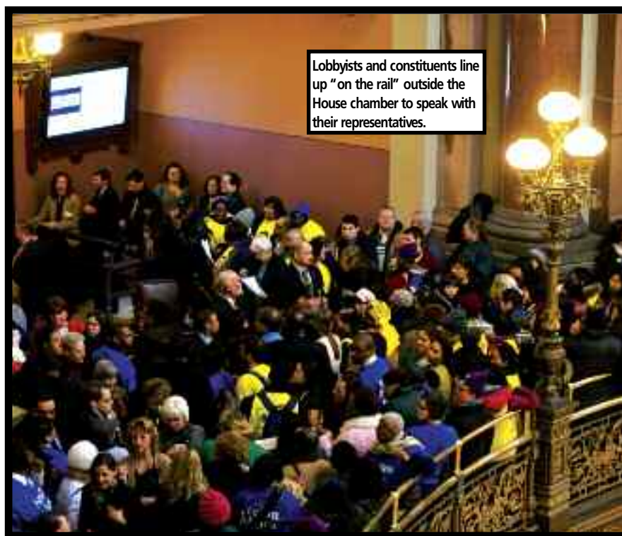
Lobbyists and constituents line up "on the rail" outside the House chamber to speak with their representatives.

provide a chance to override an amendatory veto by Gov. Pat Quinn that would allow any citizen access to public-employee performance evaluations. The union initiated HB 5154 to counter action last year, when the freedom of information law was revised to make the performance evaluation of any public employee working for any jurisdiction in the state of Illinois, except for teachers and school officials, available to any citizen who requests it. It would have nullified that provision and kept public-employee performance evaluations confidential. But Quinn's amendatory veto left most AFSCME members in the public sector still vulnerable. The union will lobby for an override motion in both chambers.