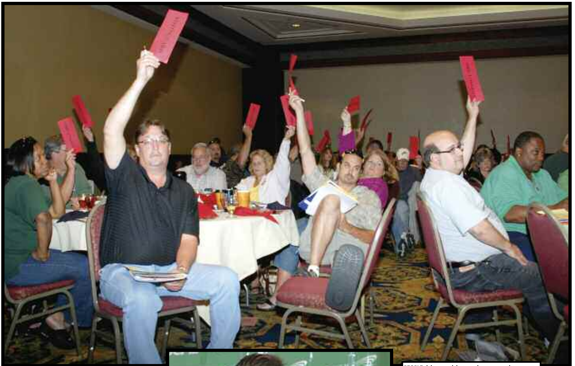
PEOPLE delegates debate and vote on endorsements.

A democratic process that winds its way through 11 regions around the state and ends at the Council 31 PEOPLE conference has resulted in a list of candidates union members are urged to consider when they enter polling places for the Nov. 2 general election.