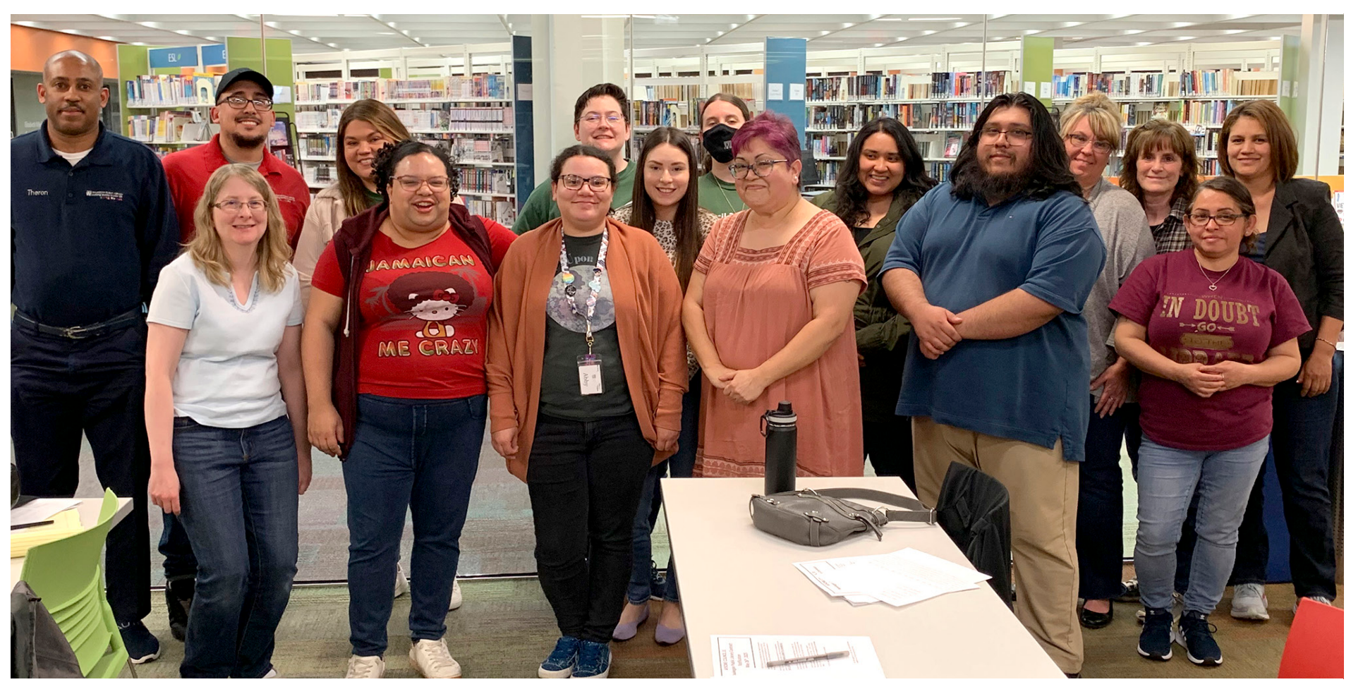
Waukegan Public Library workers voted to ratify their first contract, which immediately boosts pay across the board by 7%.

Under the extension, all full-time county employees are now eligible for 12 weeks of paid parental leave. This leave is extended to non-birthing biological parents, surrogate parents and those fostering a child.