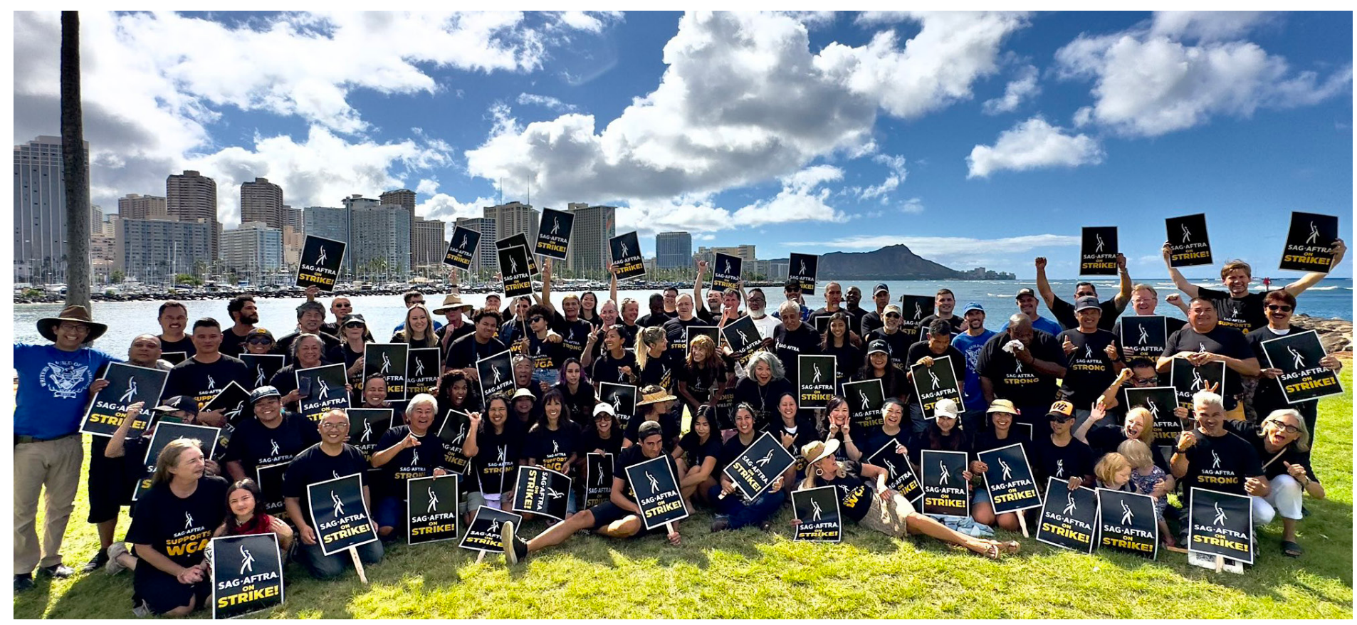
Members of SAG-AFTRA on strike in Hawaii.