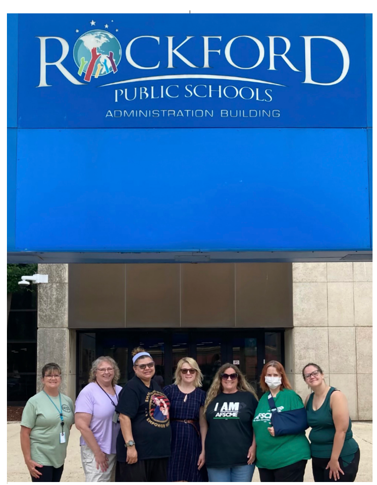
Members of the Local 1275 bargaining committee.