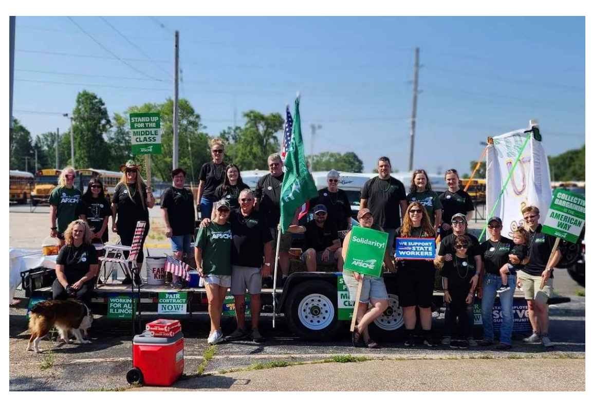
Members of AFSCME Local 417 at Macomb's Heritage Day Parade in June.

■ he more than 150 Western Illinois University building service workers (BSWs) and clerical workers of AFSCME Local 417 knew that bringing the broader community into their fight for a fair contract was key to putting pressure on management.