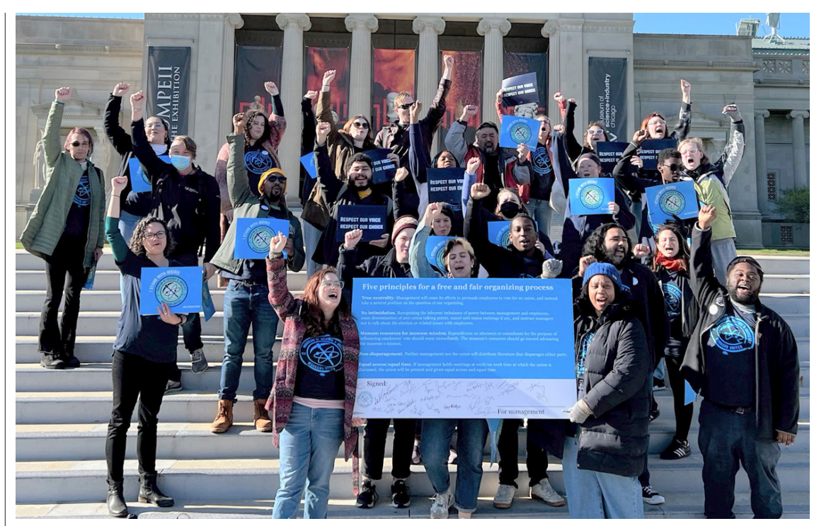
Members of MSI Workers United call on the museum to cease its anti-union campaign at an April action.

"When we found out about the kind of money the