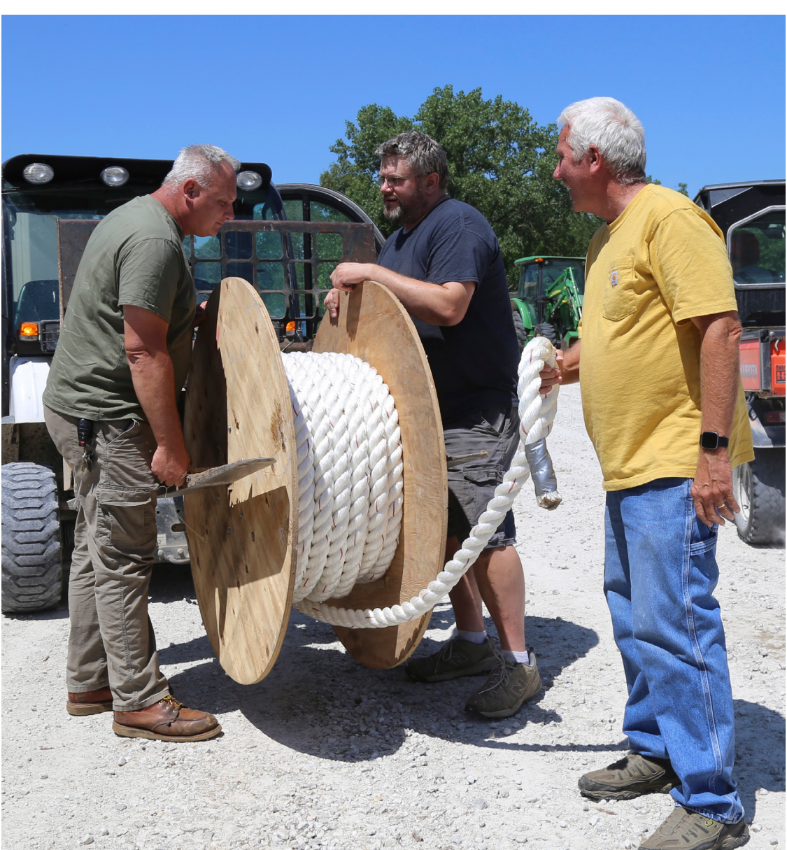
Members of Local 2794 measure a length of rope to be installed on the obstacle course.