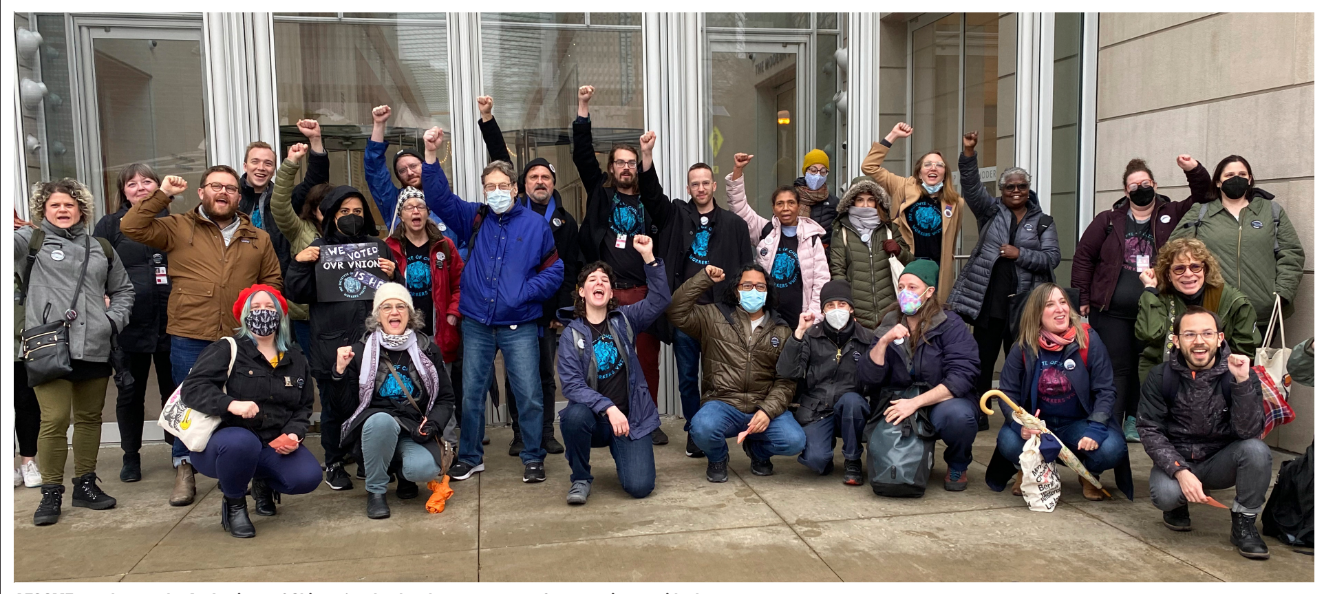
AFSCME members at the Art Institute of Chicago's school and museum pose after an action outside the museum.