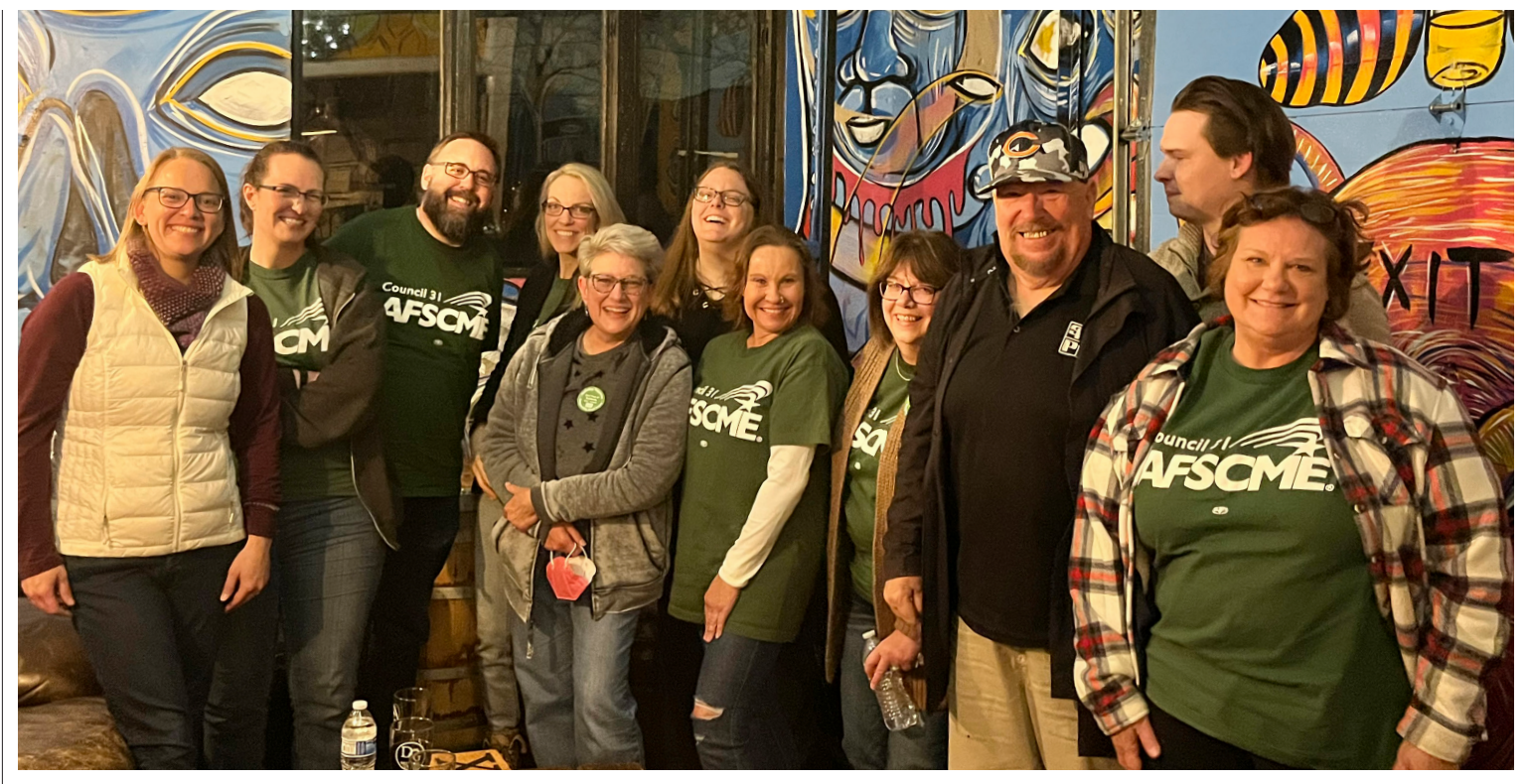
Members of the St. Charles Public Library bargaining committee celebrate with a night out after reaching a tentative agreement on their first contract.

Members of the bargaining committee were especially concerned about wages for customer-service representatives, the public-facing workers who process late or missed toll payments and provide customer support. The local's lowest-paid members, they were suffering the most from high inflation.