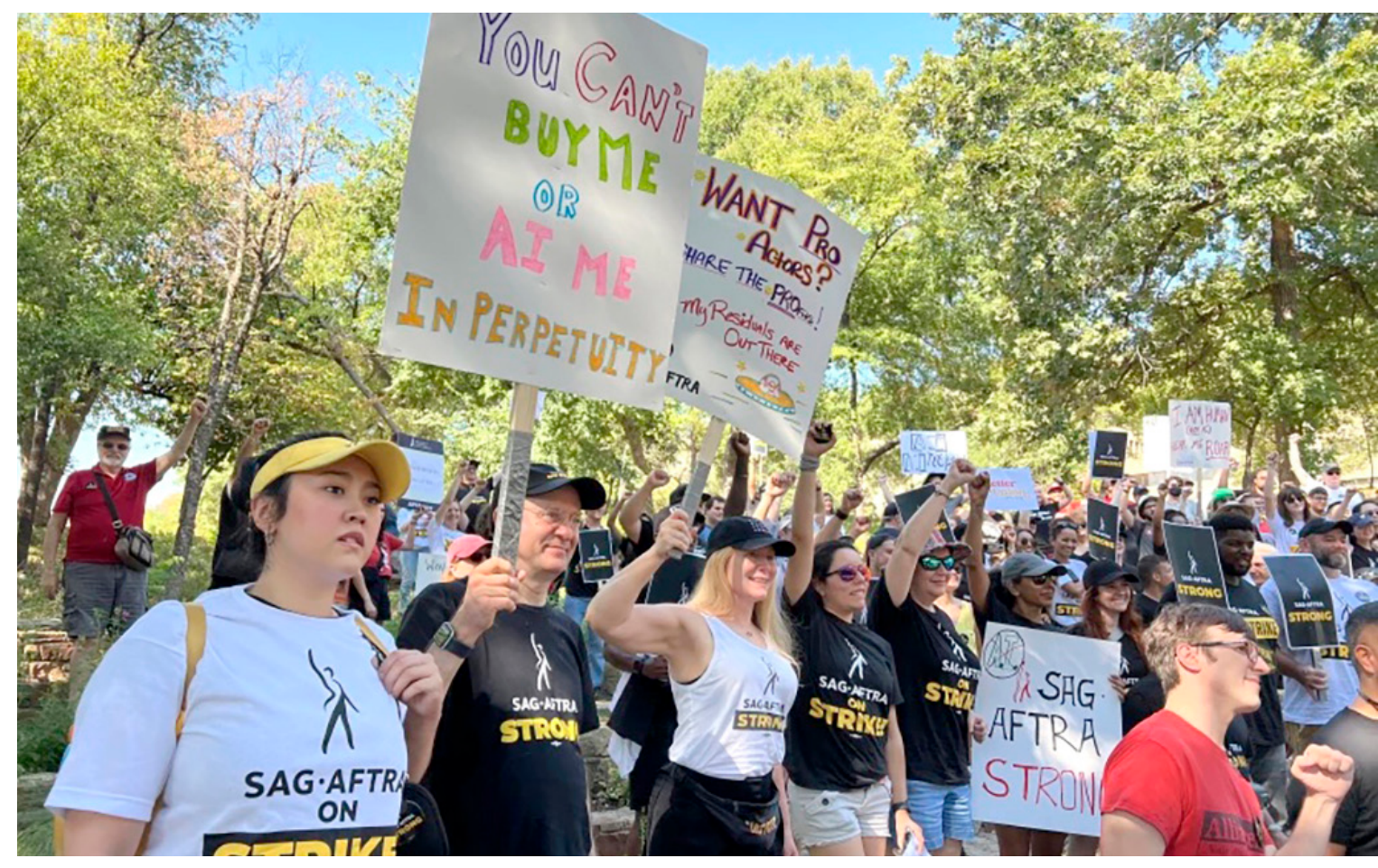
Members of SAG-AFTRA on strike in New York this summer.