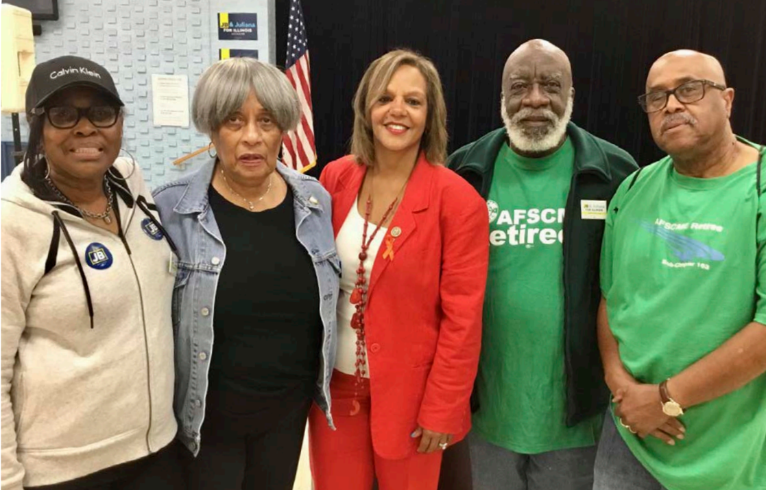
AFSCME retirees from Sub-chapter 16 (with US Rep. Robin Kelly) volunteered to get out the vote.