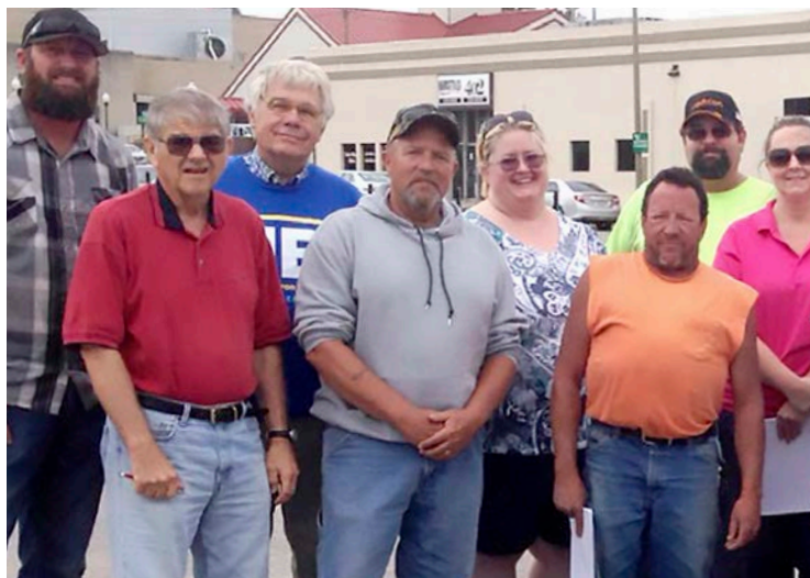
AFSCME members and retirees from Sub-chapter 87 walking precincts for Labor 2018.